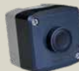
OPEN/CLOSE CONTROL AAC-PUSHB